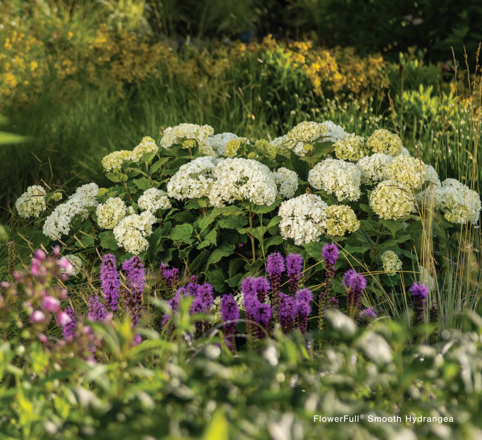
FlowerFull® Smooth Hydrangea