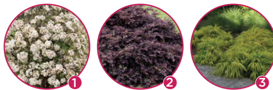
PowFume® Viburnum (1) Crimson Fire™ Fringe Flower (2) All Gold Japanese Forest Grass (3)