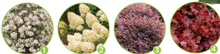
PowFume® Viburnum (1) Little Hottie® Panicle Hydrangea (2) Crimson Fire™ Fringe Flower (3) Northern Exposure™ Red Coral Bells (4)