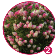
Pineapple Tart™ Potentilla (1) Berry White® Panicle Hydrangea (2)