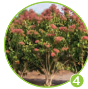
Pineapple Tart™ Potentilla (1) Little Hottie® Panicle Hydrangea (2) Shining Sensation™ Weigela (3) Tianshan® Seven-Son Flower (4)