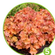
Spring Sizzle® Panicle Hydrangea (1) Iceberg Alley® Sageleaf Willow (2) Tianshan® Seven-Son Flower (3) Karl Foerster Feather Reed Grass (4) Northern Exposure™ Amber Coral Bells (5)