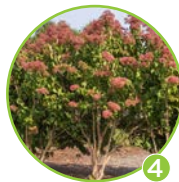
Pineapple Tart™ Potentilla (1) Little Hottie® Panicle Hydrangea (2) Shining Sensation™ Weigela (3) Tianshan® Seven-Son Flower (4)