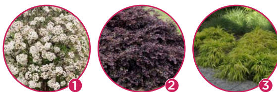
POWFume™ Viburnum (1) Crimson Fire™ Fringe Flower (2) All Gold Japanese Forest Grass (3)