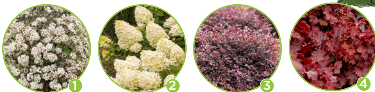
POWFume™ Viburnum (1) Little Hottie® Panicle Hydrangea (2) Crimson Fire™ Fringe Flower (3) Northern Exposure™ Red Coral Bells (4)