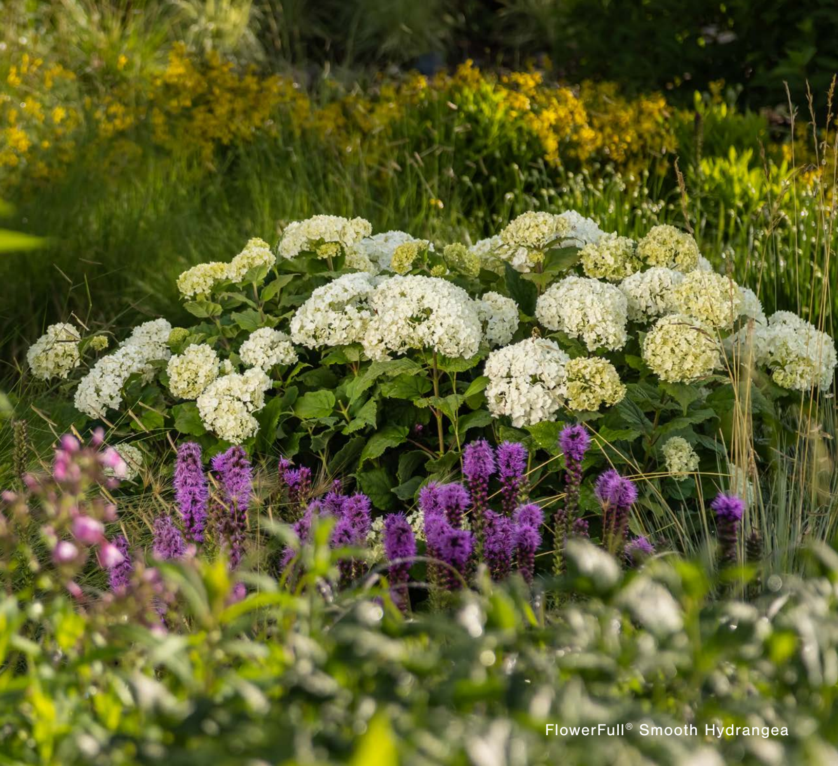
FlowerFull® Smooth Hydrangea