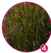
Spring Sizzle® Panicle Hydrangea (1) Tianshan® Seven-Son Flower (2) Lucky Devil® Ninebark (3) Blackhawks Big Bluestem Grass (4)

Built for a combination of performance and beauty, Spring Sizzle® is drought tolerant, has improved disease resistance, and even provides cut flowers! These qualities give it the versatility to be used as a hedge, foundation planting, or striking focal point in the landscape. Whether you're working on a residential or commercial project, this low-maintenance, high-impact shrub is a must-have for your landscape designs.