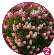
Pineapple Tart™ Potentilla (1) Berry White® Panicle Hydrangea (2)

This pollinator-friendly native selection is perfectly sized for foundation plantings, mass plantings, and erosion control. Its durability and versatility make it a great option for large-scale commercial projects as well as residential landscapes. Whether used as a focal point in mixed borders or as a functional solution for challenging sites, Pineapple Tart™ delivers reliable performance with minimal upkeep.