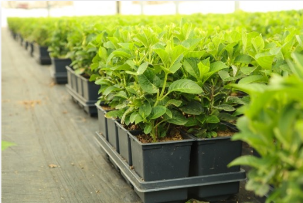
Endless Summer® The Original