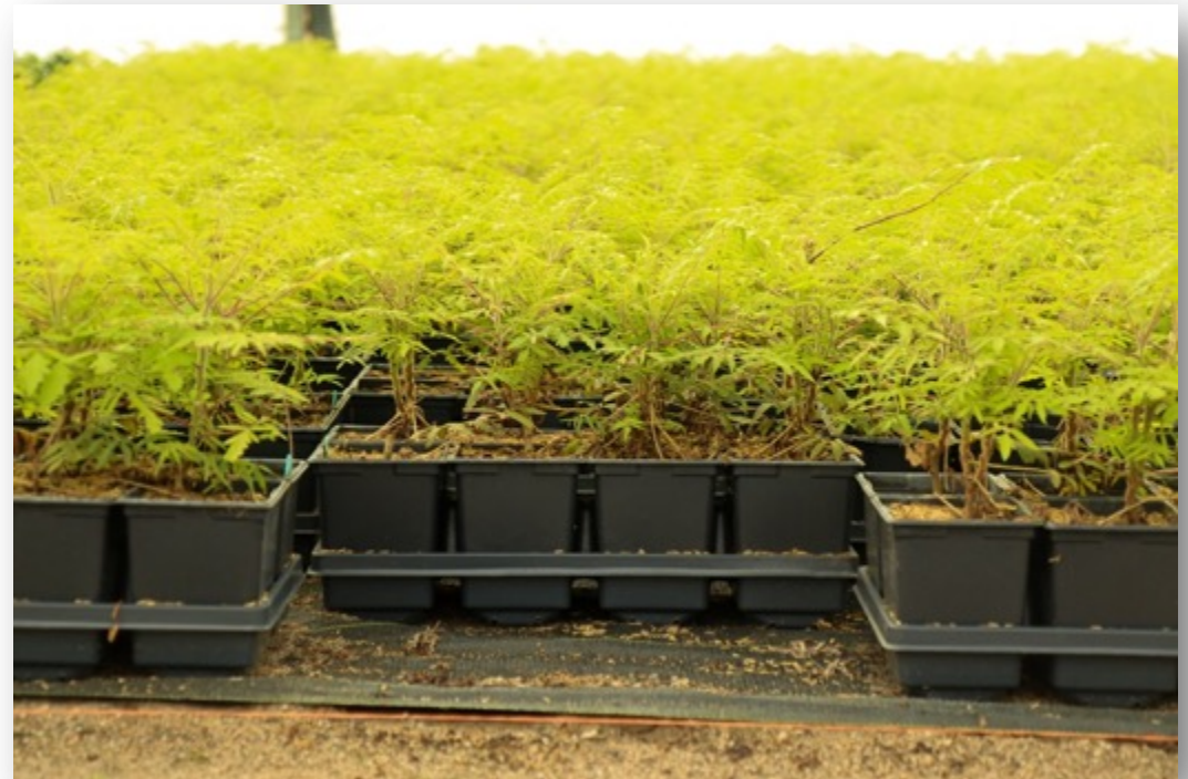
First Editions® Tiger Eyes® Sumac